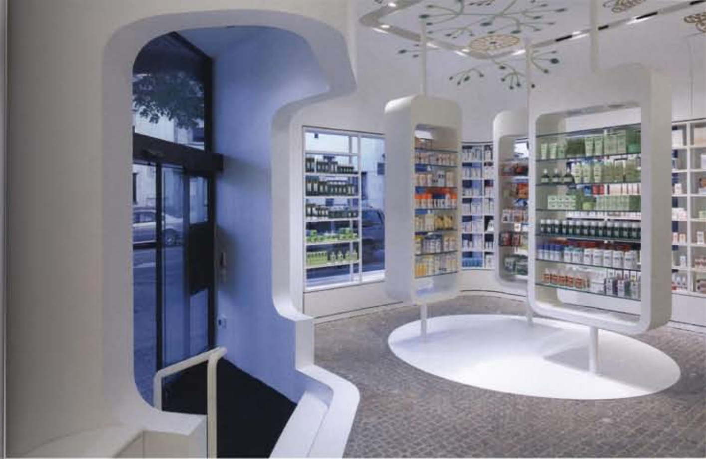
THE WALLS AND FURNITURE SHARE THE SAME SOFT ORGANIC WHITE FORM, SET OFF BY THE COBBLED FLOOR AND MERCHANDISE.