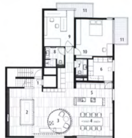
Lower level plan