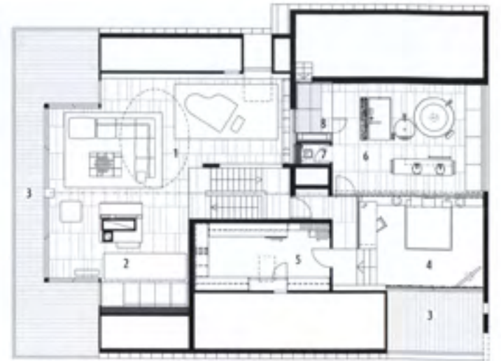
Mezzanine and upper level plan