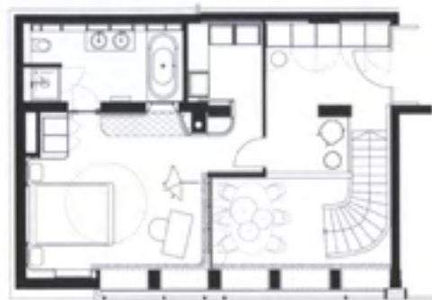
Upper floor plan