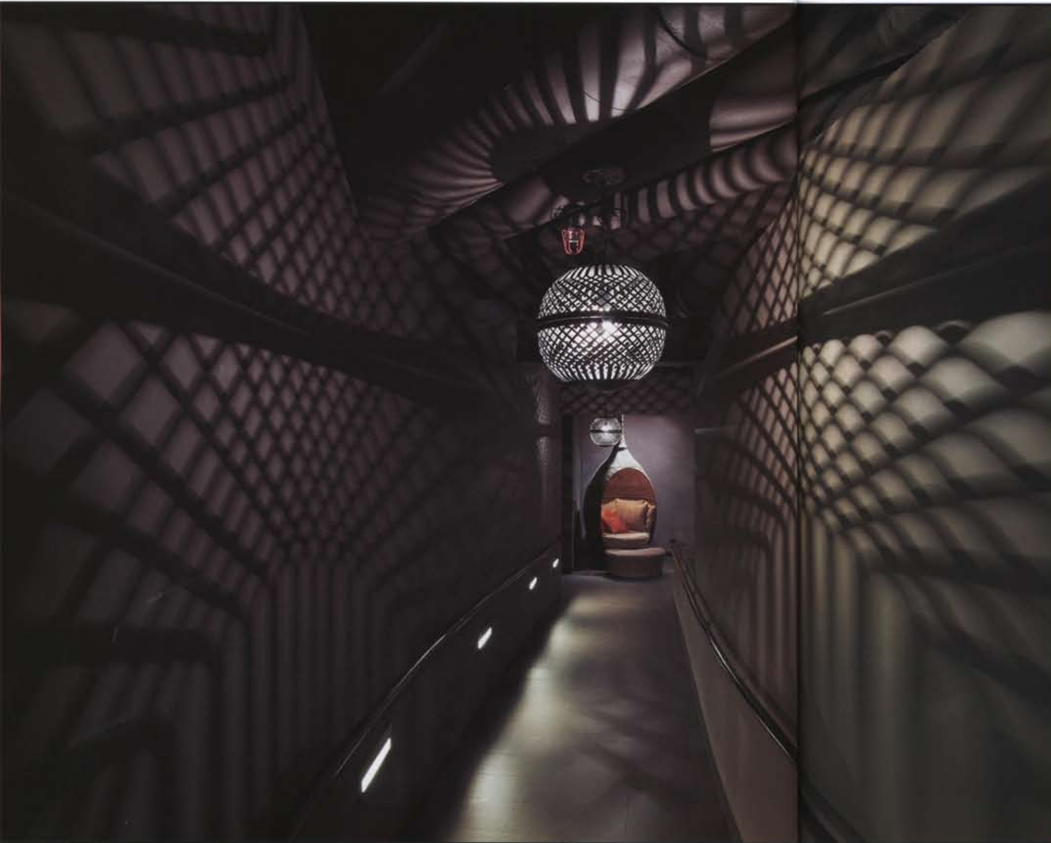
STUDIO SOFIELD Pendant globes of recycled metal alloy at the David Barton Gym and Spa, Miami Beach.