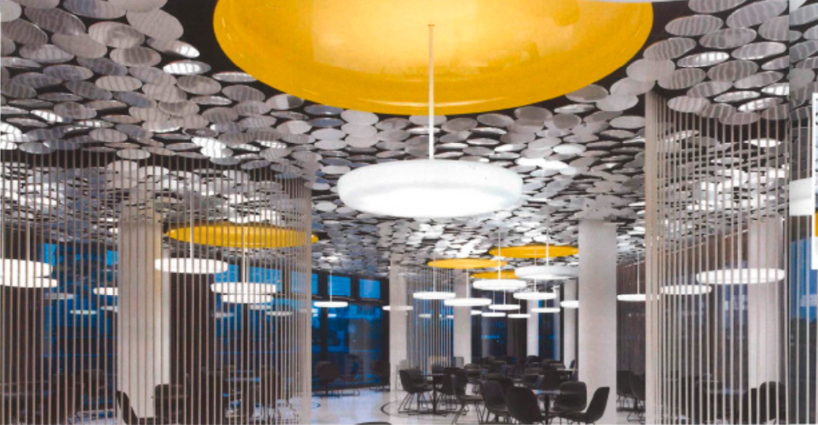
Left: DER SPIEGEL canteen. Bottom, left: Ippolito Fleitz Group Office, Stuttgart.